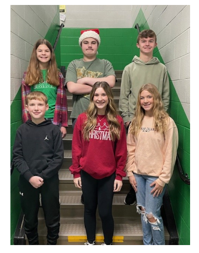
Students of the month: