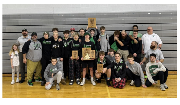
HS Wrestling Team—Charles Swank Memorial Invite Champions! Congratulations team! Way to represent in a BIG way!

The Girls basketball team is currently 7-2 overall and 4-1 in the MOAC. Their next game is December 28, at home vs. Highland at 6/7:15 pm. Good Luck Girls!!