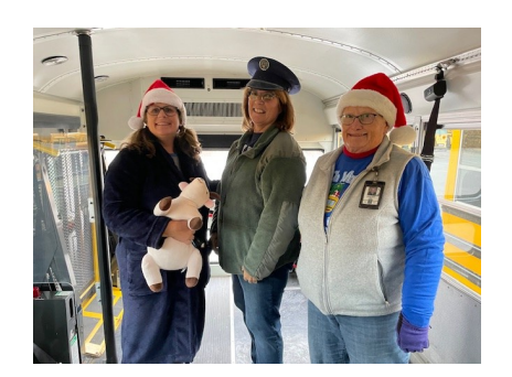
Bus #17 is now The Polar Express!!