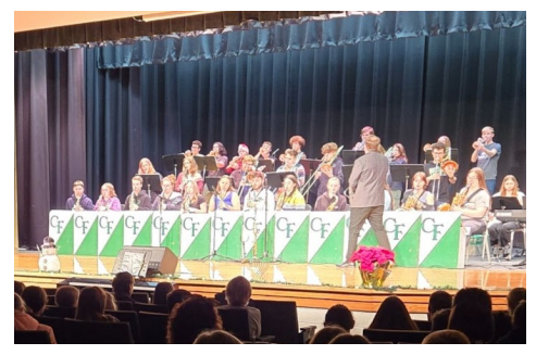
High School Artisans and Band Concert that the 4th and 5th Grade students attended.