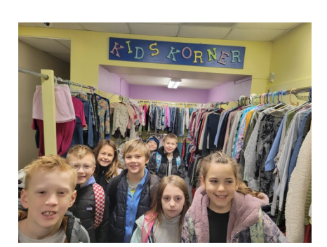
Bellville 2nd grade students donated 2 OVERFLOWING shopping carts of non-perishable foods, toiletries, socks and hats. There was over 105lbs of food! This is great community service right here! Great job kids!