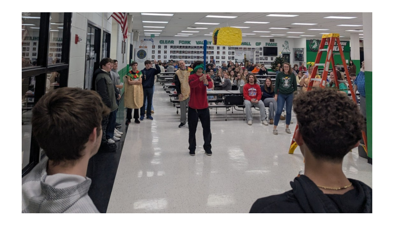
PBIS "Burrito Day" was a bit "hit", complete with a pinata for students.