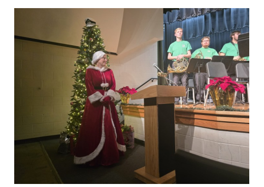
Mrs. Claus even made an appearance at the Choir Concert!