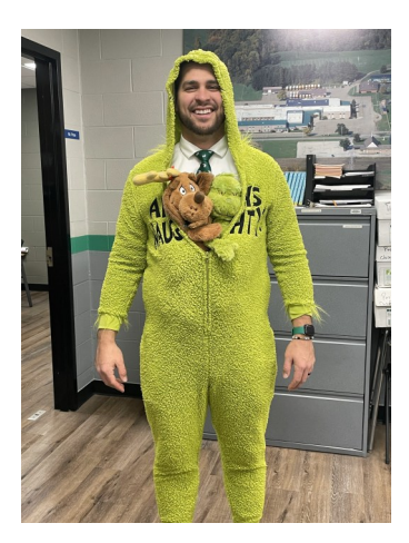
Does the Grinch get presents or coal? Hmmmm...