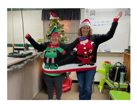
Have a doubly great Christmas!!