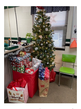
The Transportation Team adopted a family in need from Holiday Happiness. What a generous act of kindness for a wonderful cause!! Here is a photo of the donated gifts.