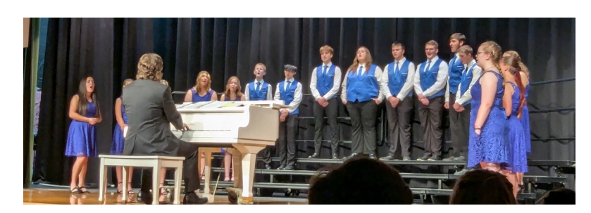
The Artisans performing at the high school Holiday Choir Concert.