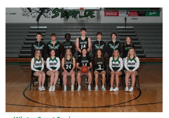
Winter Sport Seniors