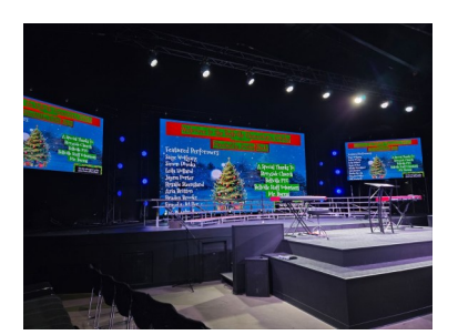
Holiday Concert at Storyside Church - December 16th